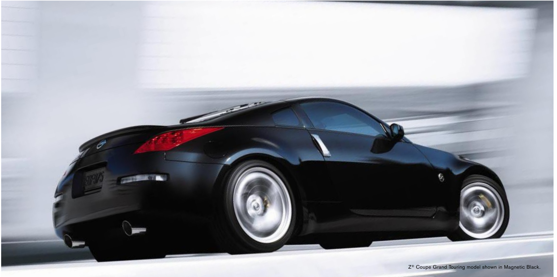
Z® Coupe Grand Touring model shown in Magnetic Black.