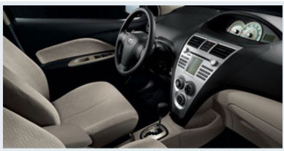
Yaris Sedan interior shown in Bisque with available Power Package and accessory floor mats