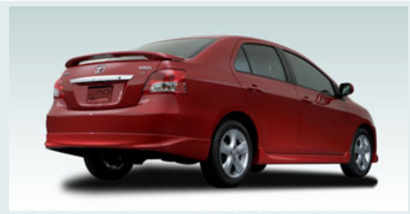
Yaris S Sedan shown in Barcelona Red Metallic with available 15-in. aluminum alloy wheels and rear spoiler