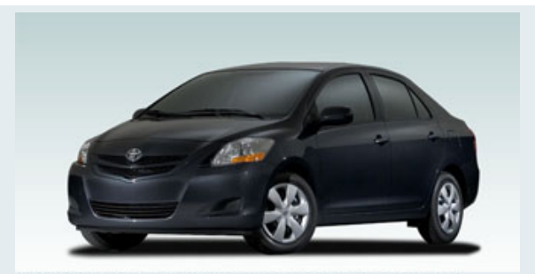
Yaris Sedan shown in Flint Mica with available 15-in. steel wheels with full wheel covers