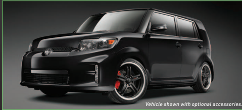
Vehicle shown with optional accessories.