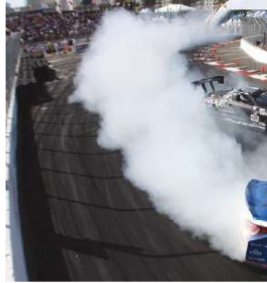
Genesis Coupe modified by Rhys Millen Racing. Professional driver on a closed course. Do not attempt.