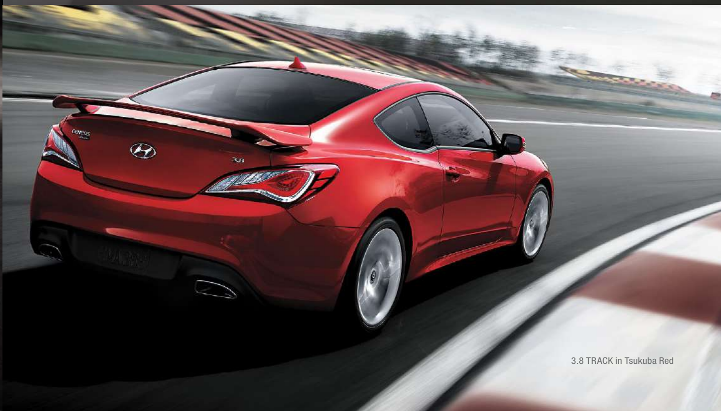
3.8 TRACK in Tsukuba Red

1 Horsepower and torque ratings with premium fuel.