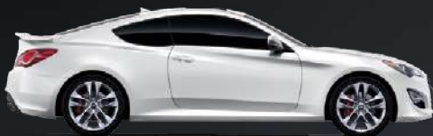
WHITE SATIN PEARL