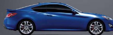
SHORELINE DRIVE BLUE*