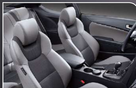
2.0T PREMIUM GREY LEATHER BOLSTER / GREY CLOTH INSERT