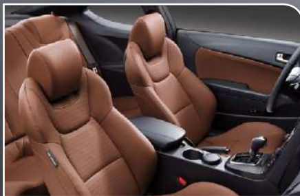
3.8 GRAND TOURING TAN LEATHER