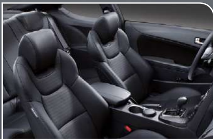
3.8 GRAND TOURING / 3.8 TRACK BLACK LEATHER