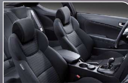
2.0T BLACK CLOTH