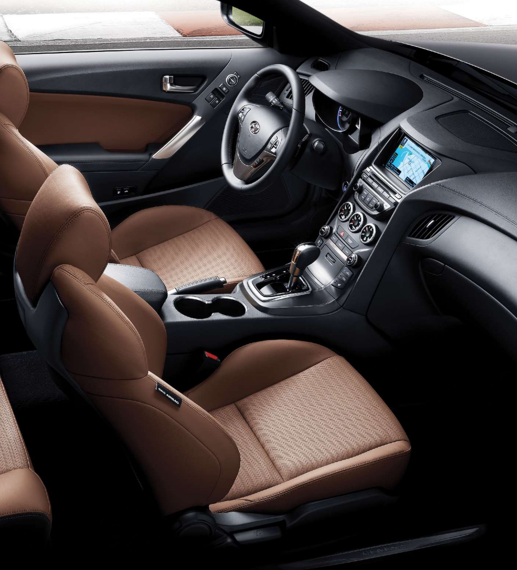
3.8 GRAND TOURING in Tan Leather