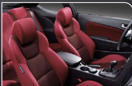
2.0T & 3.8 R-SPEC RED LEATHER BOLSTER / RED CLOTH INSERT