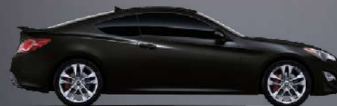
BLACK NOIR PEARL