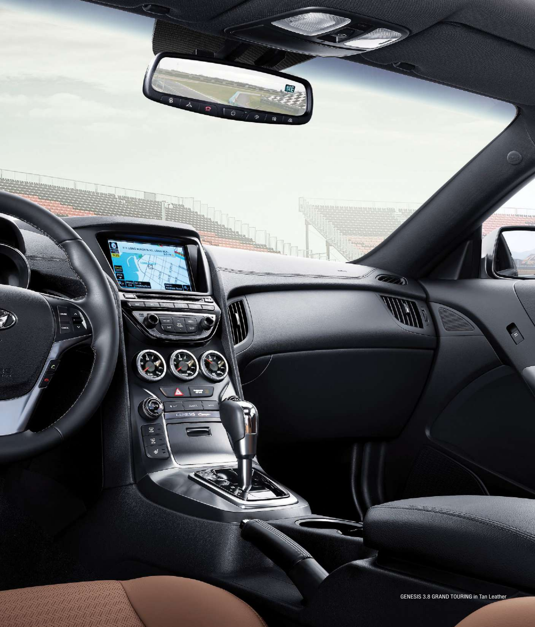
GENESIS 3.8 GRAND TOURING in Tan Leather