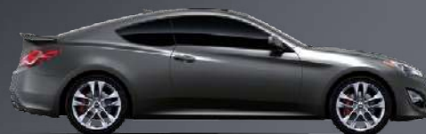
GRAN PREMIO GRAY