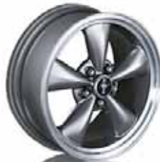
17" Painted-Aluminum with Tri-Bar Pony Center Cap Standard with V6 Pony Package