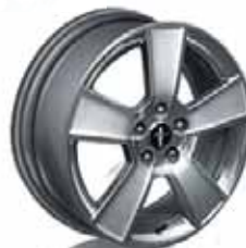
18" Premium Aluminum with Tri-Bar Pony Center Cap Available on GT