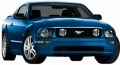
Vista Blue Metallic