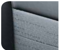
V6 CLOTH *MUSTANG* Pattern