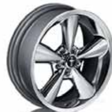
18" Polished-Aluminum with Tri-Bar Pony Center Cap Available on GT; Standard with GT California Special Package