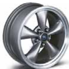
17" Painted-Aluminum Standard on GT