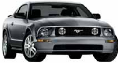
Tungsten Grey Metallic