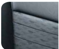
GT CLOTH Stampeding Horse Pattern