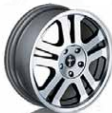
17" Bright Machined-Aluminum with Tri-Bar Pony Center Cap Available on GT and V6 Premium