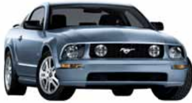
Windveil Blue Metallic