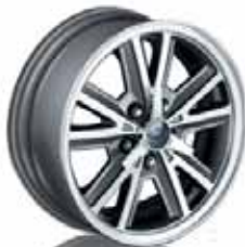
16" Bright Machined-Aluminum with Chrome Spinner Standard on V6 Premium; Available on V6 Deluxe