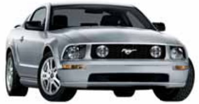
Satin Silver Metallic