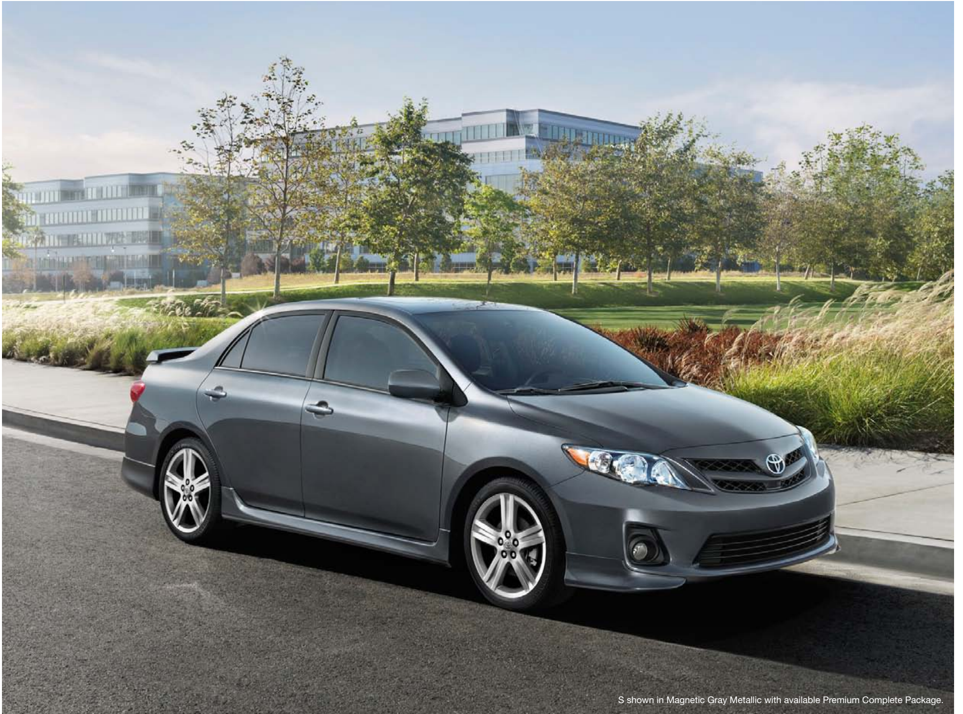
S shown in Magnetic Gray Metallic with available Premium Complete Package.