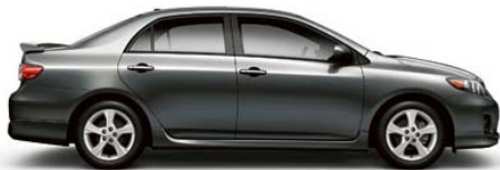
MAGNETIC GRAY METALLIC