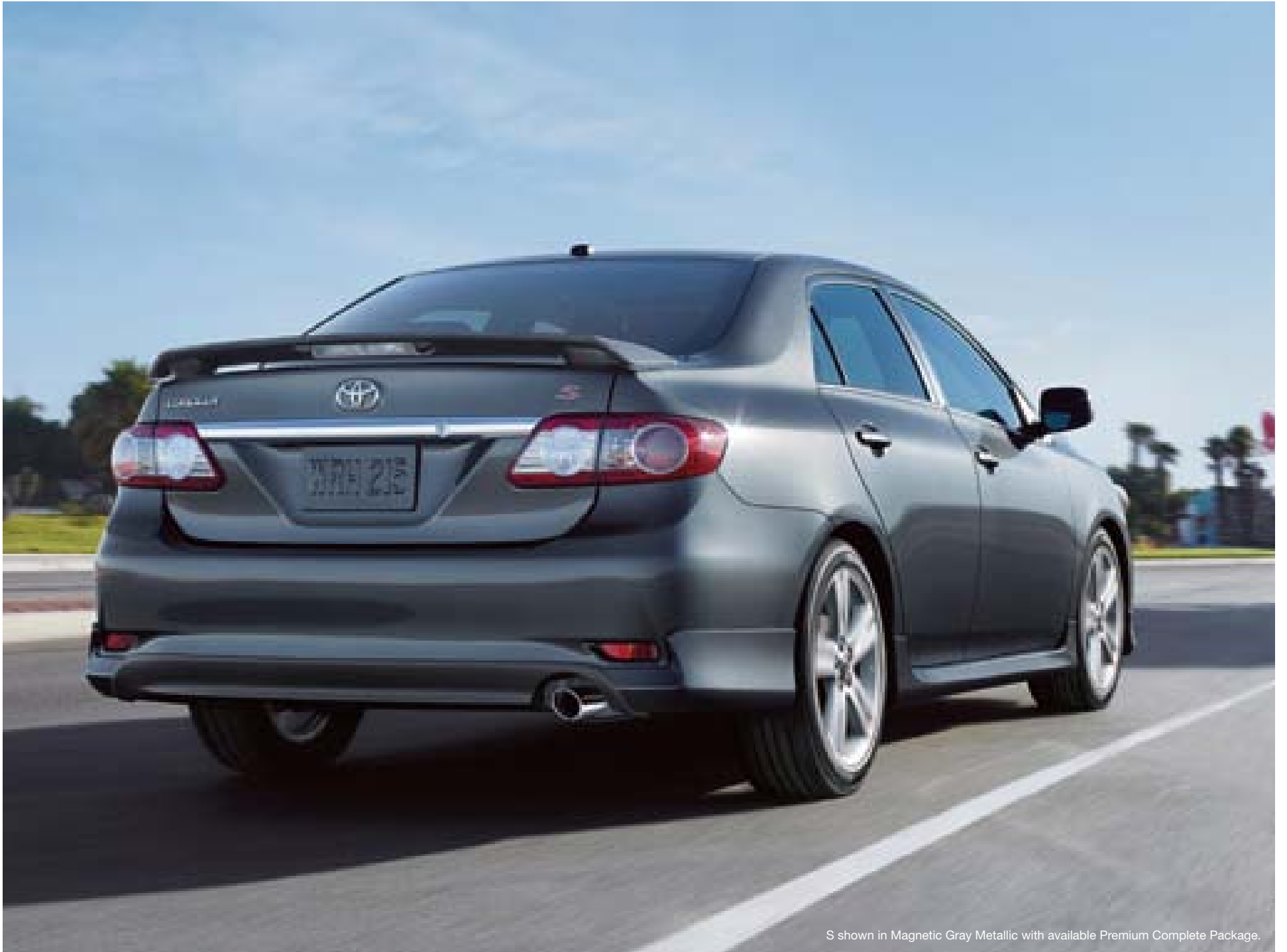
S shown in Magnetic Gray Metallic with available Premium Complete Package.