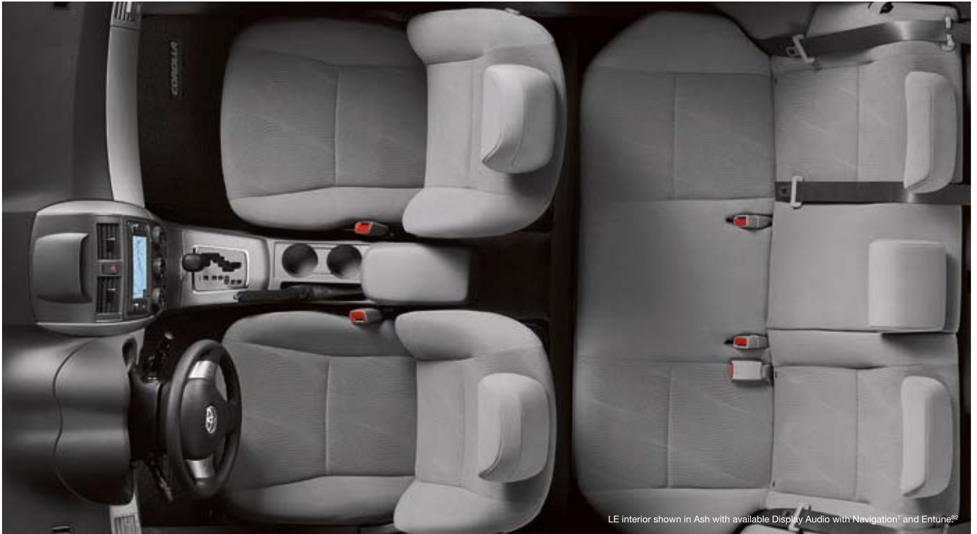
LE Interior shown in Ash with available Display Audio with Navigation 1 and Entune. 2

1. See footnote 10 in Disclosures section. 2. See footnote 11 in Disclosures section.