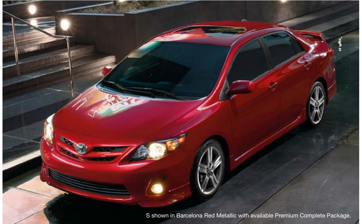
S shown in Barcelona Red Metallic with available Premium Complete Package.

Corolla's impeccable road manners begin with its rigid chassis. Built to resist body flex, it provides a reliable platform so that the suspension can do its job. The front suspension, mounted to an additional sub-frame to reduce noise and vibration, is tuned for precision handling. In back, the rear suspension employs a torsion-type design that further smooths the ride quality.