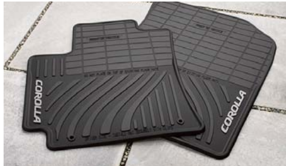
All-weather floor mats 22