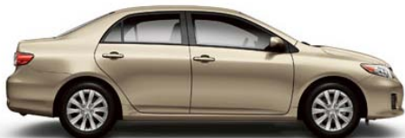
SANDY BEACH METALLIC