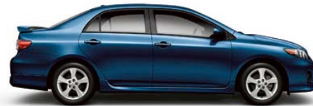
NAUTICAL BLUE METALLIC