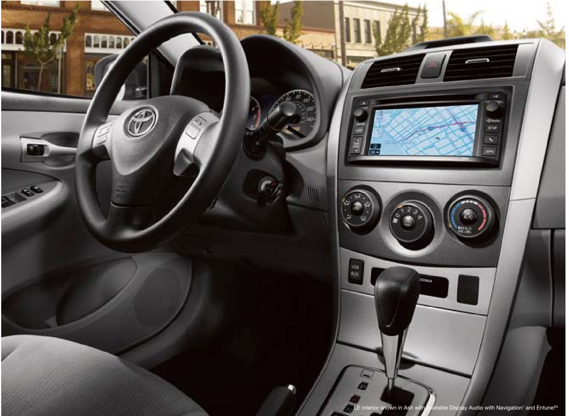
LE interior shown in Ash with available Display Audio with Navigation 1 and Entune ®2