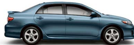
TROPICAL SEA METALLIC