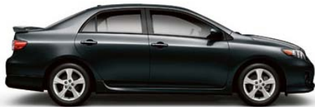
BLACK SAND PEARL