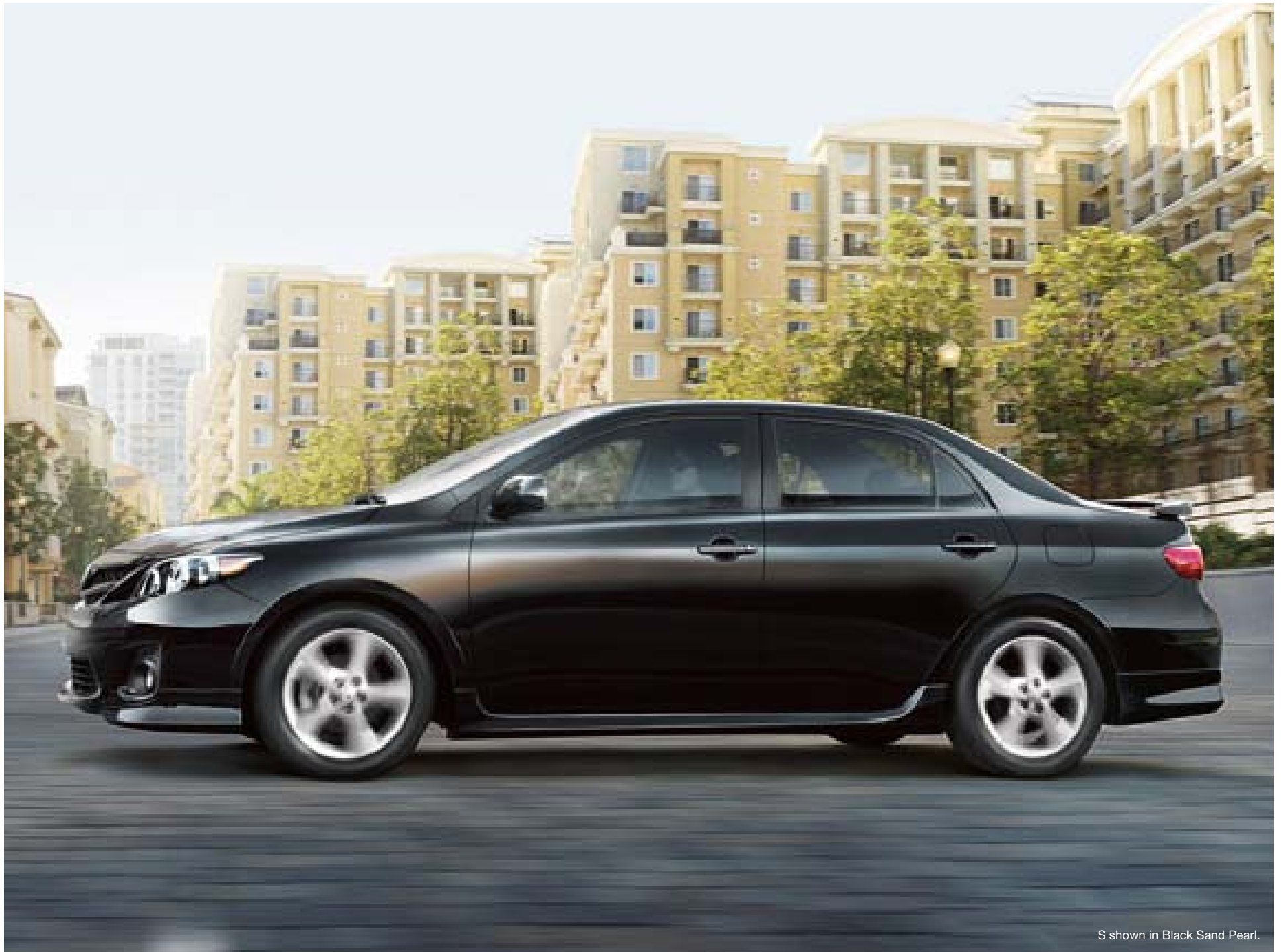
S shown in Black Sand Pearl.