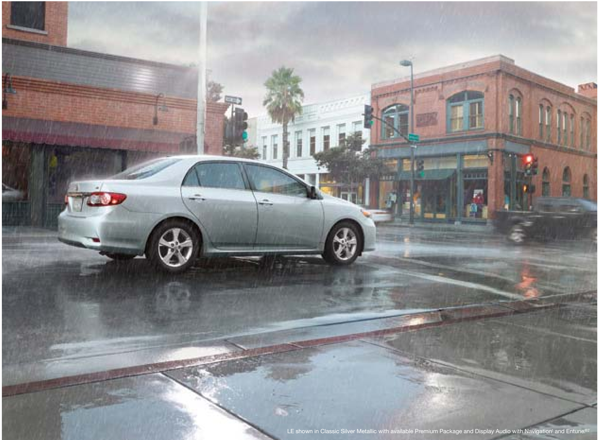
LE shown in Classic Silver Metallic with available Premium Package and Display Audio with Navigation 1 and Entune. 2

1. See footnote 10 in Disclosures section. 2. See footnote 11 in Disclosures section.