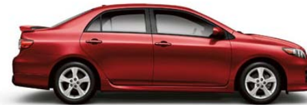
BARCELONA RED METALLIC