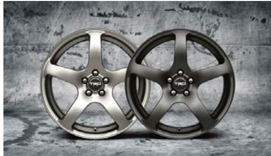
TRD 18-in. alloy wheels 27